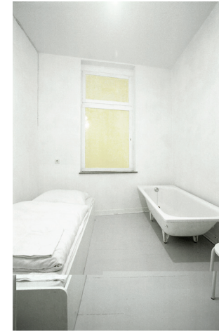
u r 19, LIEBESLAUBE, 1995